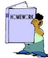
do your homework