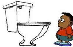
go to the bathroom