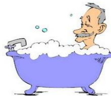
take a bath