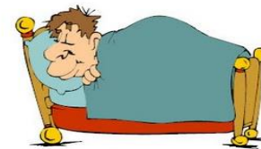
go to sleep