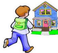
come home / get home